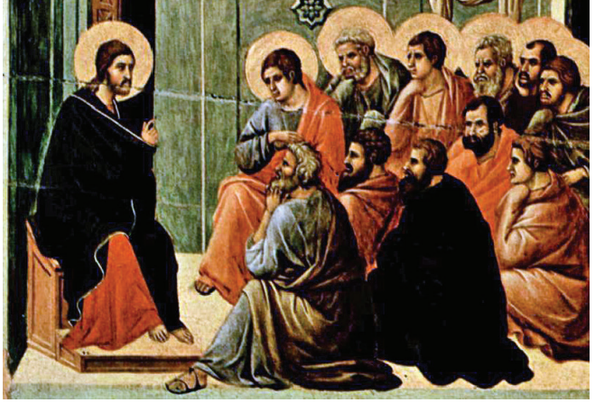
Christ's Farewell to His Apostles by Duccio

Today's lesson looks at the connection between the Passover Meal and the Last Supper. When the people of Israel were slaves in the land of Egypt, God freed them from slavery during the Exodus. The Passover occurred in the midst of the Exodus, on the night when God sent the angel of death into Egypt to strike down their first born, God asked Israel to eat unleavened bread and to sacrifice a pure lamb and sprinkle its blood over the door. The lamb's blood served as a sign of the faith of God's people and the angel of death passed over the house. In the midst of Jesus' work of salvation, a new Passover called the Paschal Mystery, Jesus offered Himself as the pure lamb of God. At the Last Supper, Jesus transformed bread into His own flesh and wine